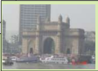
Picture clue — 2 Down